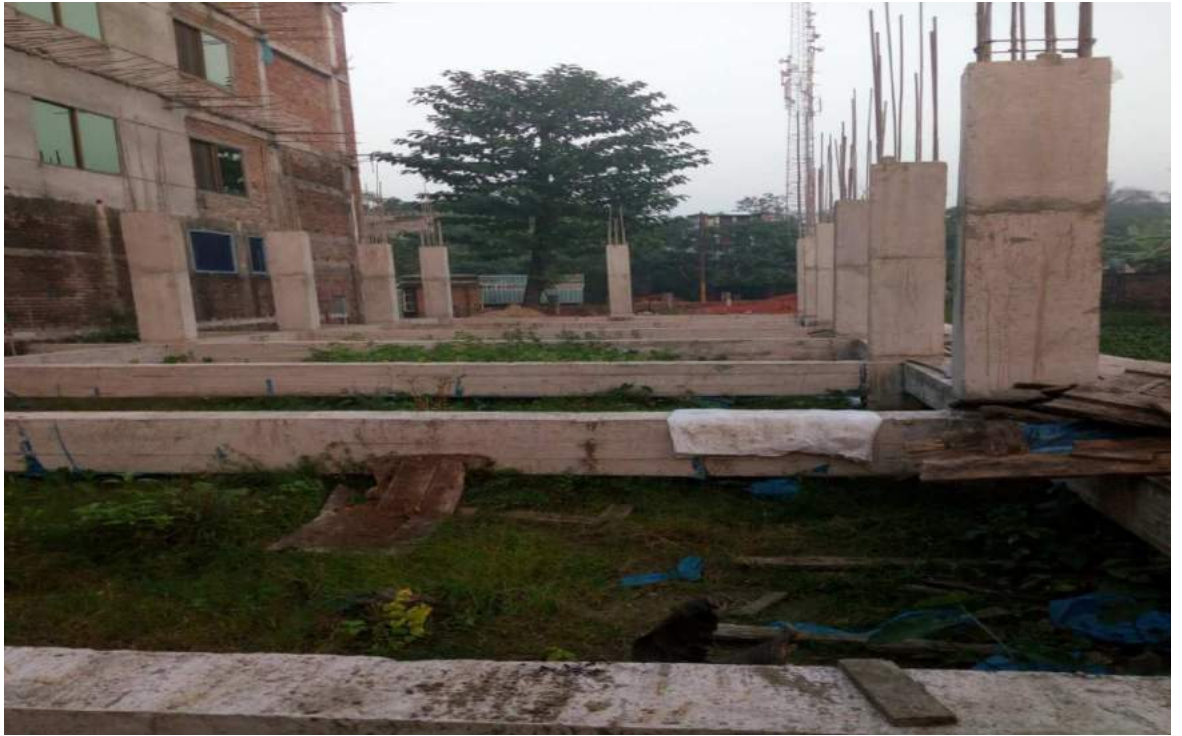
New building – under construction