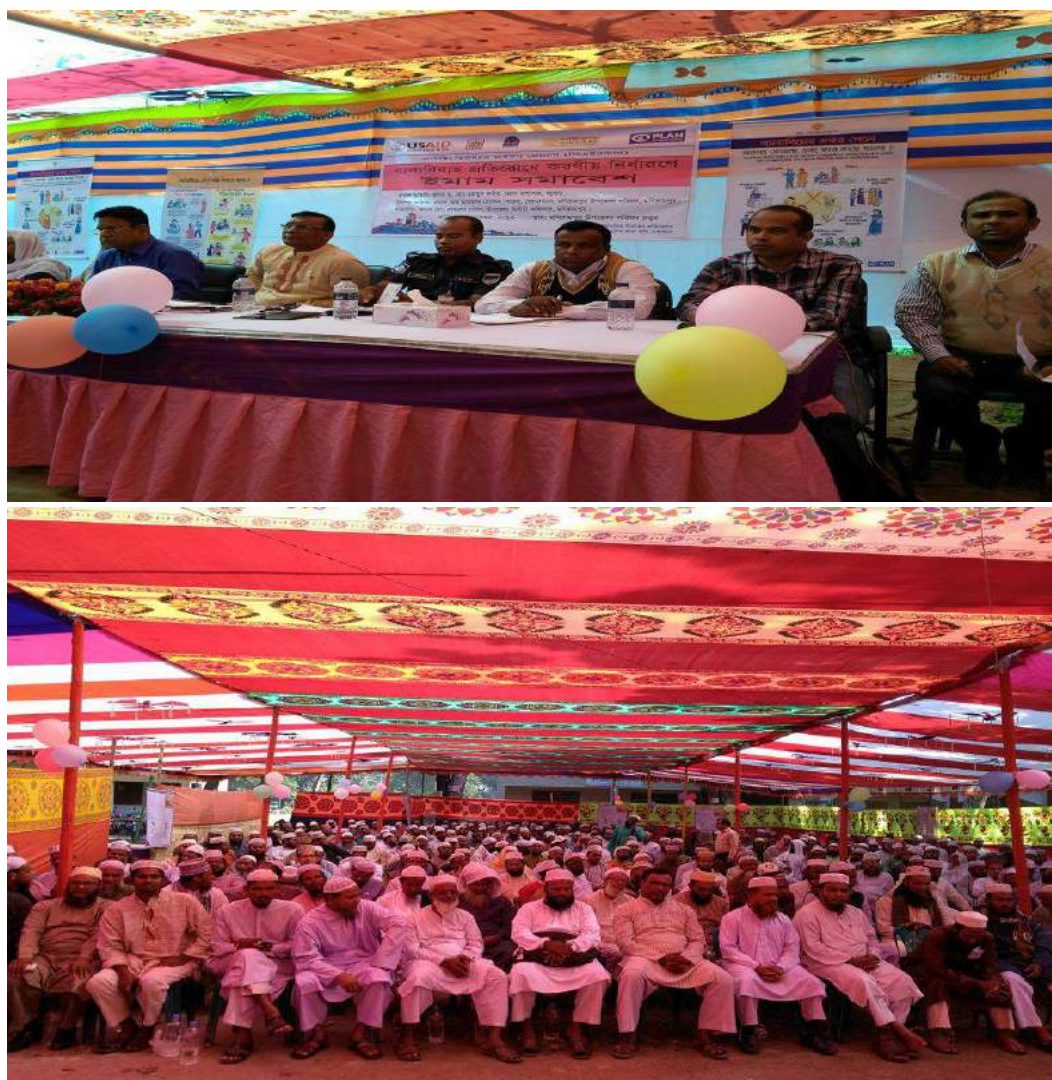
Immam Conference on awareness of Early Child Marriage and Role on Immam