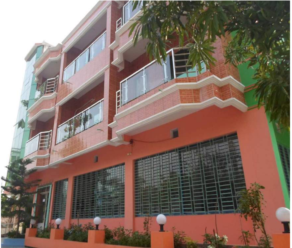
BS New ITRAD Building